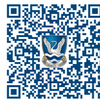
The Girls' School Advantage - Video

We aim to provide an environment which is friendly and safe.