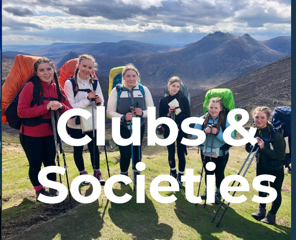
CCF (Cadets), DofE, SU, Film, Gardening, Games, Science, Dance, Baking, Debating