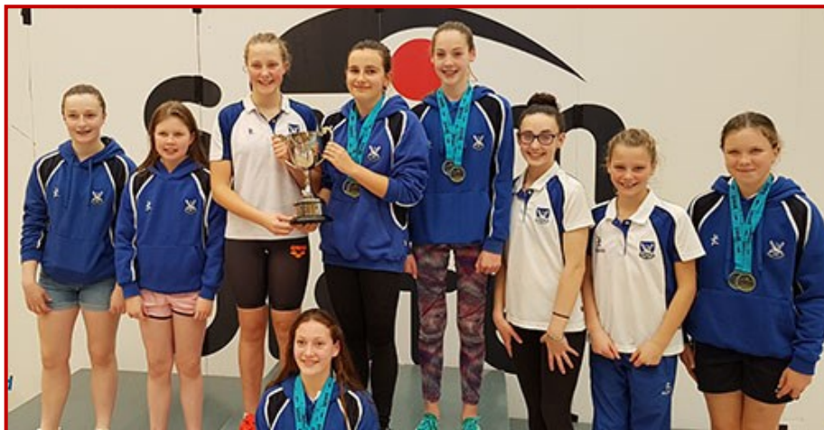
Junior Swim Team