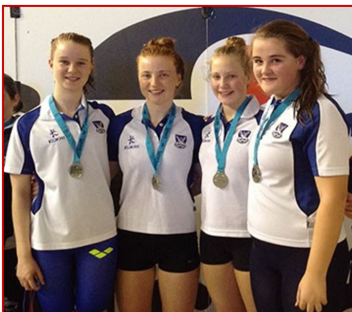
Senior Relay Team