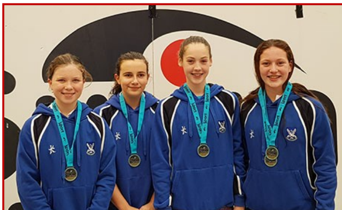
Junior Relay Team